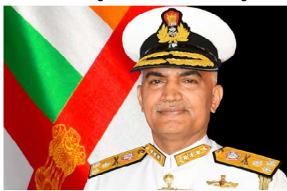
Chief of Naval Staff Admiral R Hari Kumar

"The first batch of Agniveers have already reported. About 3,000 Agniveers have joined out of which 341 are women. This is a landmark event for us because for the first time, the Navy is inducting women sailors. We have been inducting women officers for about the last 16-17 years, but this is for the first